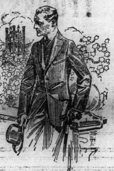
Society Brand Clothes

INCLUDING Society Brand Clothes for young men and men who stay young. The most exclusive and the finest suits made, every garment, individually cut and hand tailored. The very best of foreign and American woolsens. Suits that have no equal anywhere. If you are thinking of buying a new suit don't fail to see these Stylish Suits, you'll surely like them. Priced at