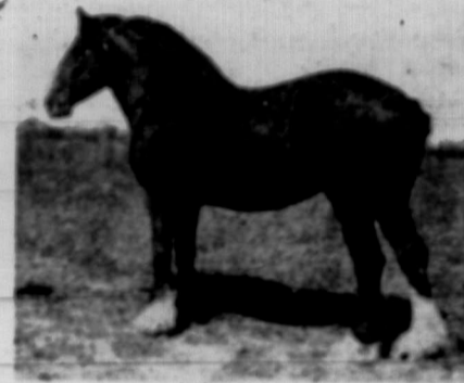
be sold under the hammer. Complete Catalogue containing photographs and extended pedigrees of animals to Colony Farm Office.