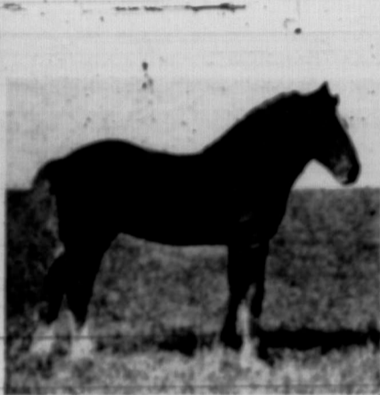
Colony Farm's heavy importation of selected Prize Winners from Scotland laid the foundation of this great collection of horses, some forty head of which will