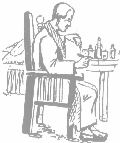
The Old Way.

Long ago, when I first lifted my voice of warning against drugs and patent medicines and began my first great fight in favor of Electricity as a curative agent, I found anything but smooth sailing against superstition and prejudice, but, knowing I was on the right track, I pounded away, backing my judgment with what money I had, and have lived to see the great change of sentiment that has now come over the public.