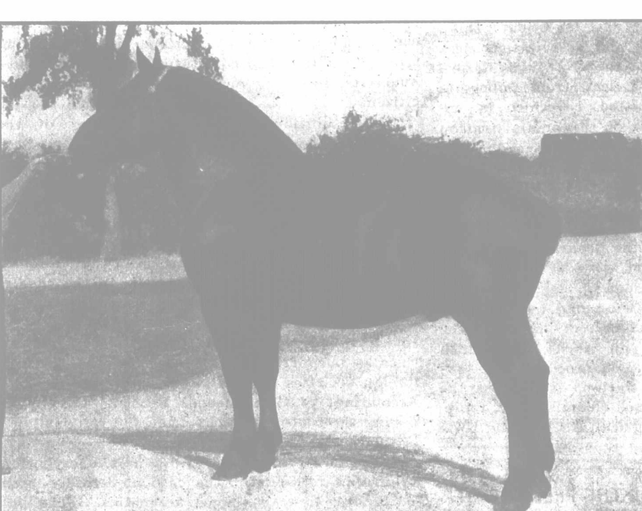
A Typical Percheron Stallion