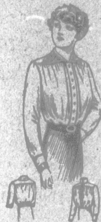
7672 Gathered Blouse with Square Yoke, 34 to 42 bust.