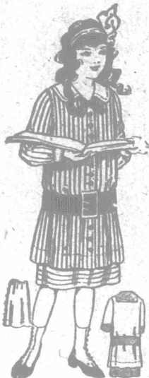
8478 Girl's Dress, 10 to 14 years.

Name..... Post Office..... County..... Province..... Number of pattern..... Age (if child or misses' pattern)..... Measurement—Waist, ..... Bust, ..... Date of issue in which pattern appeared.