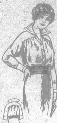
6302 Yoke Blouse, 34 to 42 bust.