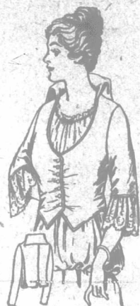
8406 Fancy Basque, 34 to 42 bust.