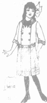
8271A Girl's Dress, 6 to 10 years.