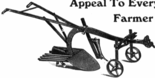
Shaker Digger with Fore Carriage

S TEEL beam.—High natural temper steel blade.—Provided with weed fender and gauge wheel.—The shaker Digger has a perfectly flat blade and will not cut the potatoes. The rod grating is hinged at the front and is given an up-and-down shaking motion by the sprocket wheel at the rear. This shakes the dirt off from the tubers and leaves them clean and whole on top of the ground. The weed fender is intended to clear away weeds and vines, preparing the way for the blade. The digger is shipped with gauge wheel and fender unless ordered without.