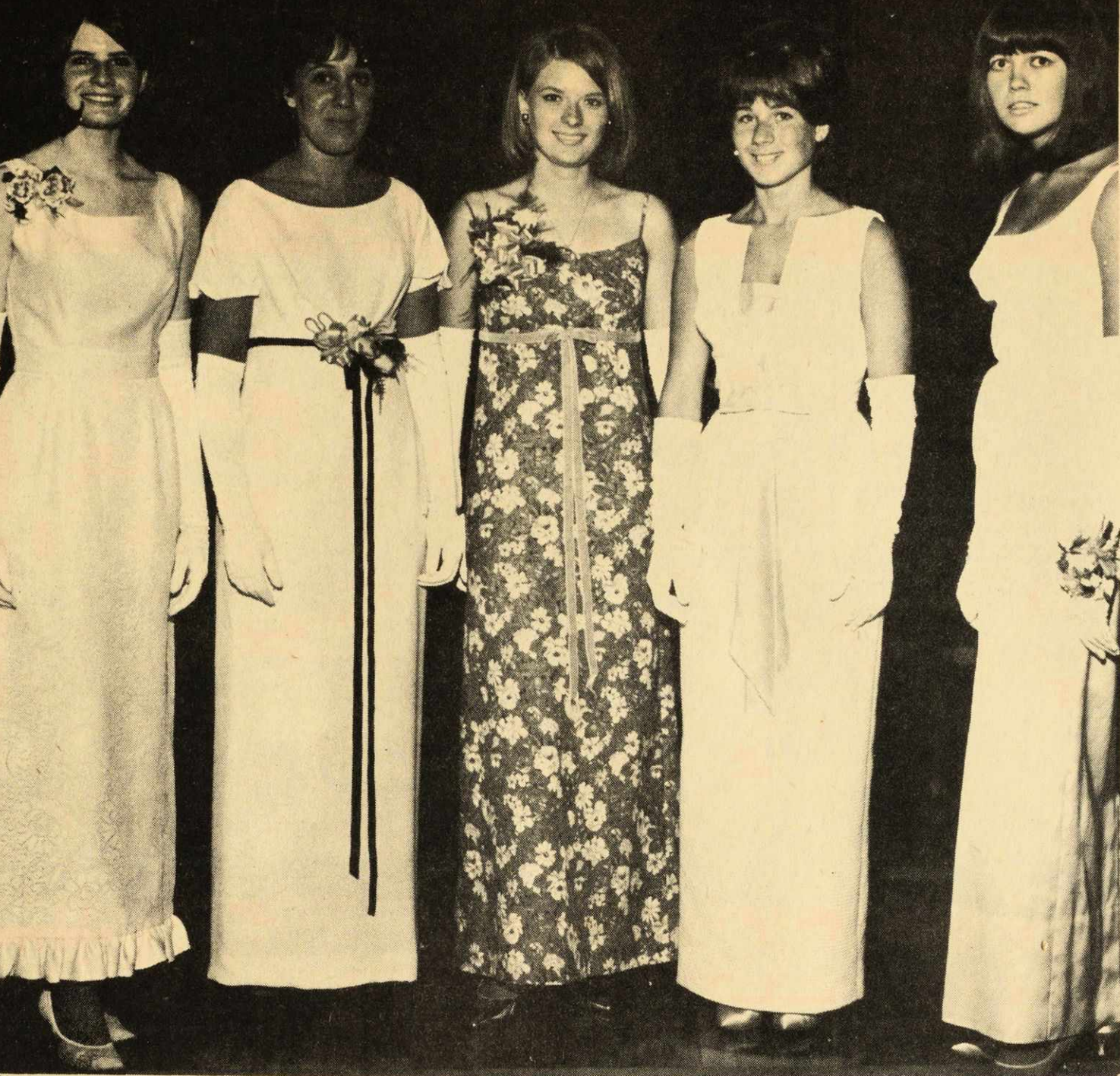
BEVY OF LOVELIES AT FRESHETTE BALL.

Perhaps the greatest asset of the film is its continual tickling -