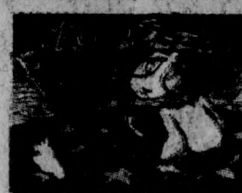
Full colour CD reviews! Entertainment, page 11