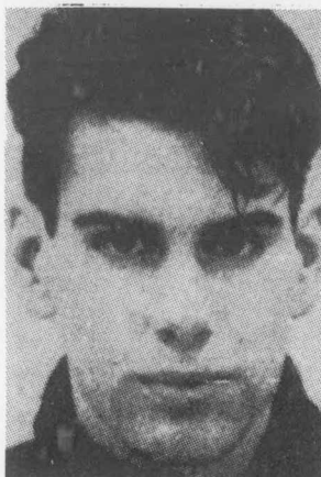
He would've gone, if he was allowed on campus.