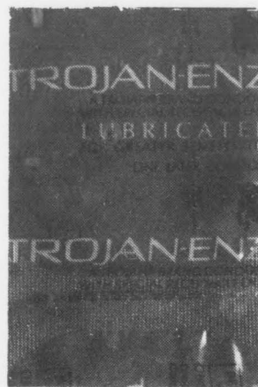
It's supposed to be HUGE! Of course I'm going!!