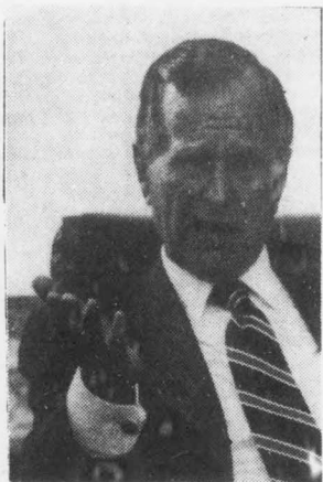
Couldn't go. Had to work.