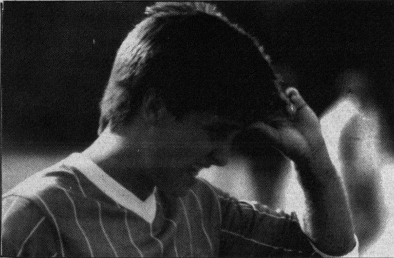
It's been that kind of season for the Golden Bear soccer team