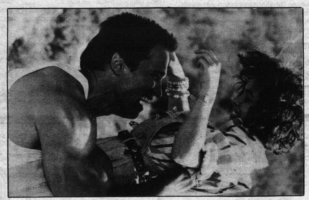
Arnold Schwarzenegger played an ex-marine with unique tastes in women in Commando 2: Play-