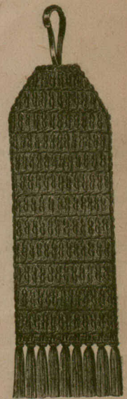
FIGURE NO. 4.—SILK WATCH-FOB.

CANDY-MAKING AT HOME.—"The Correct Art of Candy-Making at Home" is a well-written pamphlet of twenty-four pages that should find a place in every household where lovers of wholesome candy and confections dwell. A glance at the book will inform the