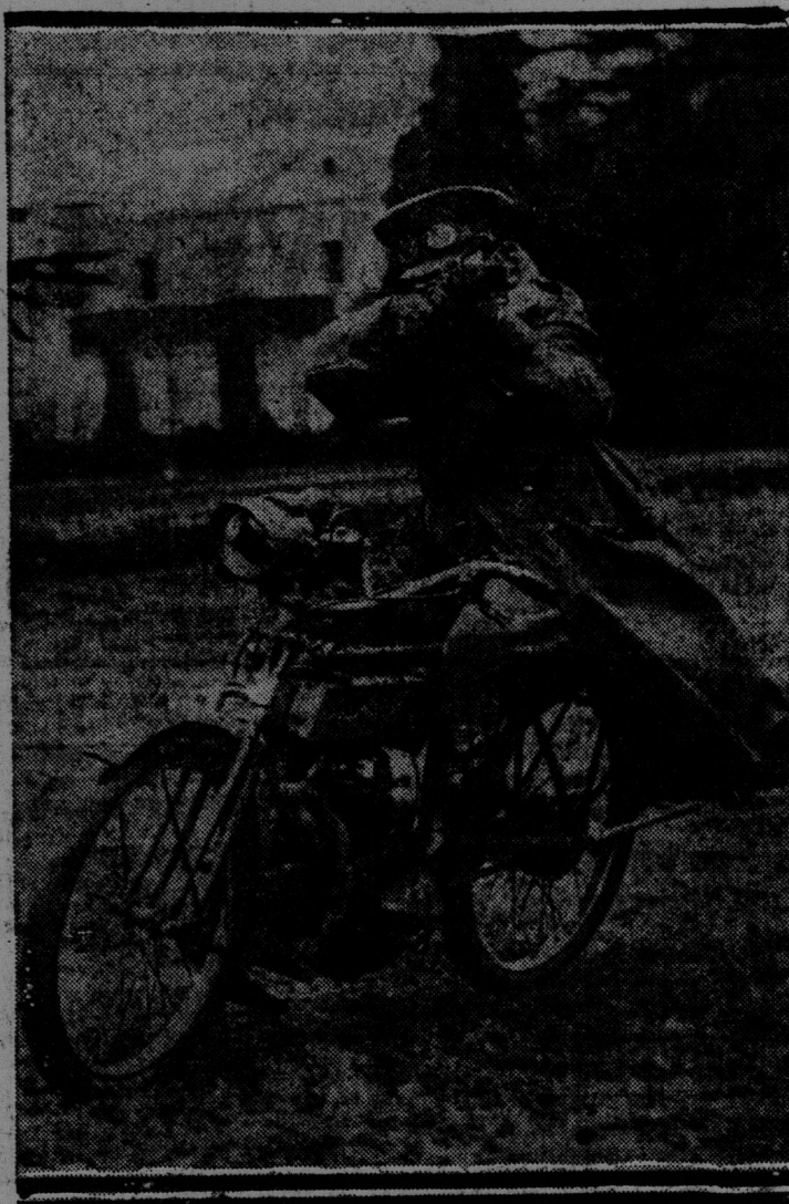
One of the keenest jobs in this war is that of motor cyclist despatch rider, who has to fight as well as speed. The picture shows an Australian rider practising at a target while speeding.