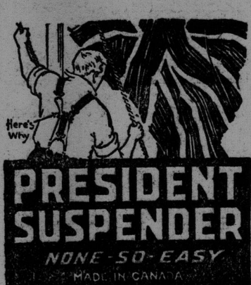
PRESIDENT SUSPENDER NONE SO EASY MADE IN CANADA

Burdock Blood Bitters is manufactured only by The T. Milburn Co., Limited, Toronto, Ont.