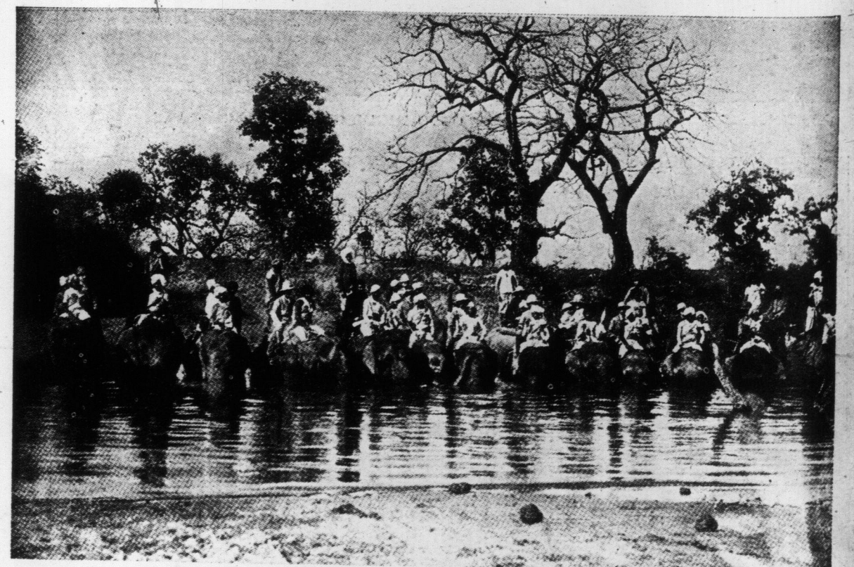
HUNTING ELEPHANTS PARADING FOR THEIR MORNING BATH.