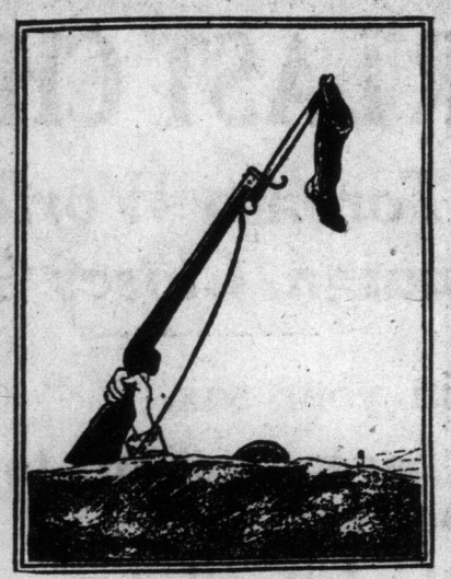
Toronto World Sox Day, Feb. 15.