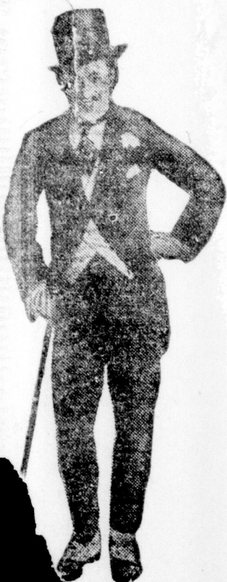
the popular screen at the Majestic and Tuesday next dies.