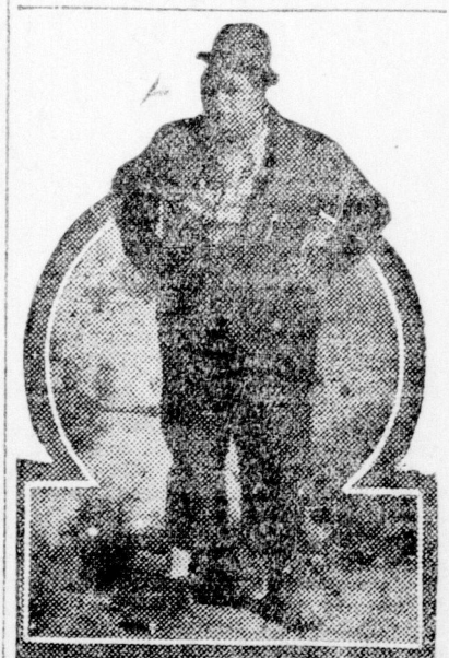
OSCOE FATTY ARBUCKLE

Dorothy Dalton is getting along fa- mously with her new picture, as yet unnamed, which is being produced at Hollywood under the personal super- vision of Thomas H. Ince. In this pic- ture Miss Dalton returns to the sort of character she depicted in "Flare-Up Sal" or "The Flame of the Yukon."