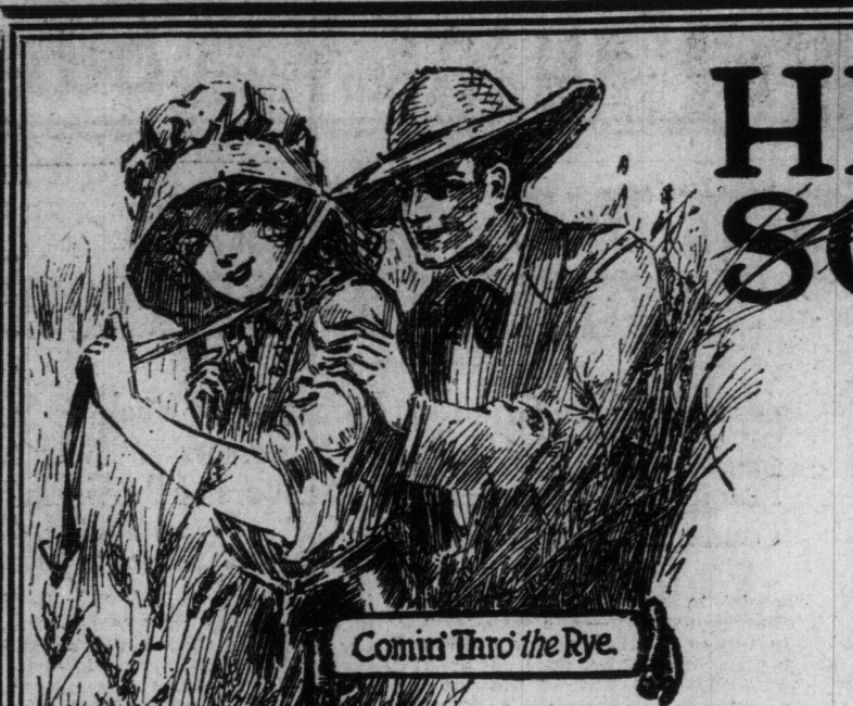
Comin' Thro' the Rye.

This picture represents the popular idea.