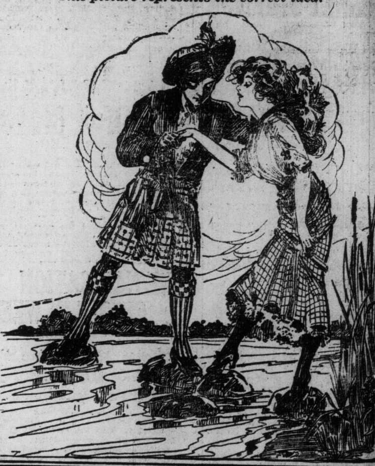
This picture represents the correct idea.

The "Rye," in the song is a little river in Scotland and "To Meet a Body Comin' Thro' the Rye," meant to meet someone crossing the river on the stepping stones. Any lad meeting a lassie crossing on the stepping stones was privileged to exact a toll of kisses.