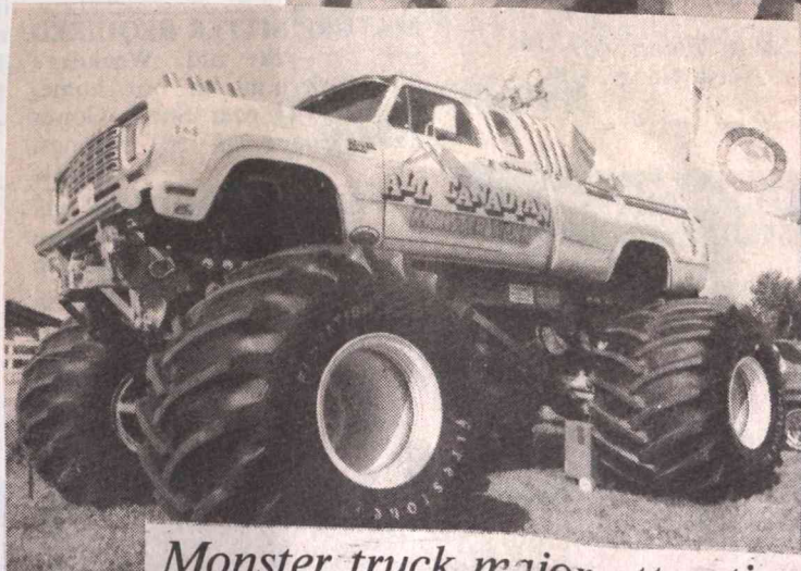
Monster truck major attraction