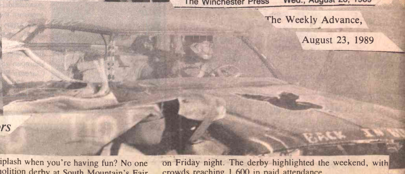
Who cares about whiplash when you're having fun? No one who entered the demolition derby at South Mountain's Fair