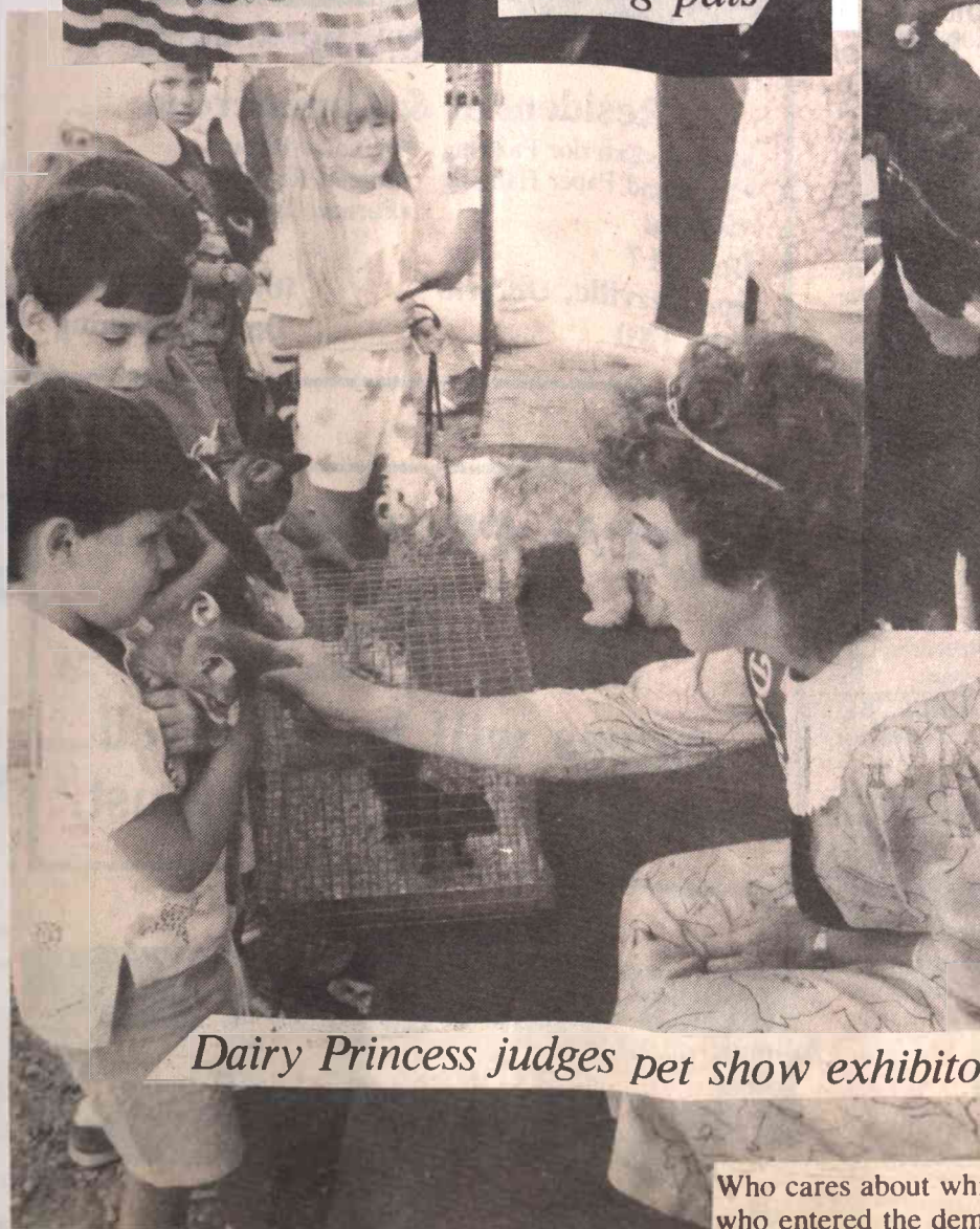
Dairy Princess judges pet show exhibitors