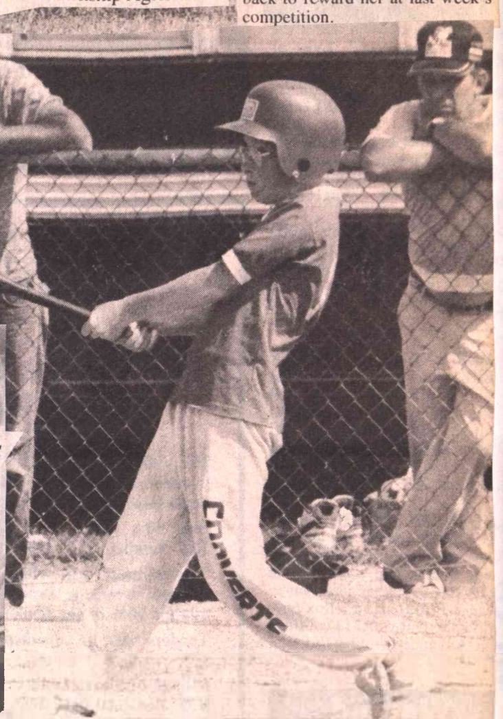
Softball action attracted large crowds