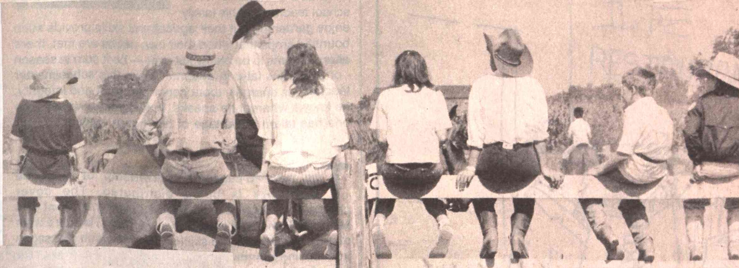
These young cowboys and cowgirls had a good view of last week's action in the judging competition of the Dundas County 4-H Horse Club Friday at the Mountain Township Agricultural Society Fairgrounds.