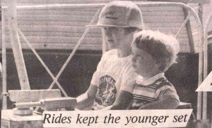
Rides kept the younger set