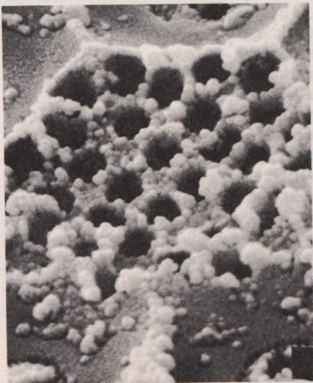
Views of fossilized sea creature