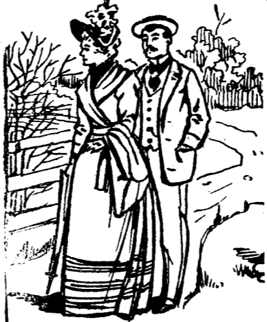
YOU'LL BE SNUBBED.

No. 508 Main St. P. O. Box 567. Telephone 195.