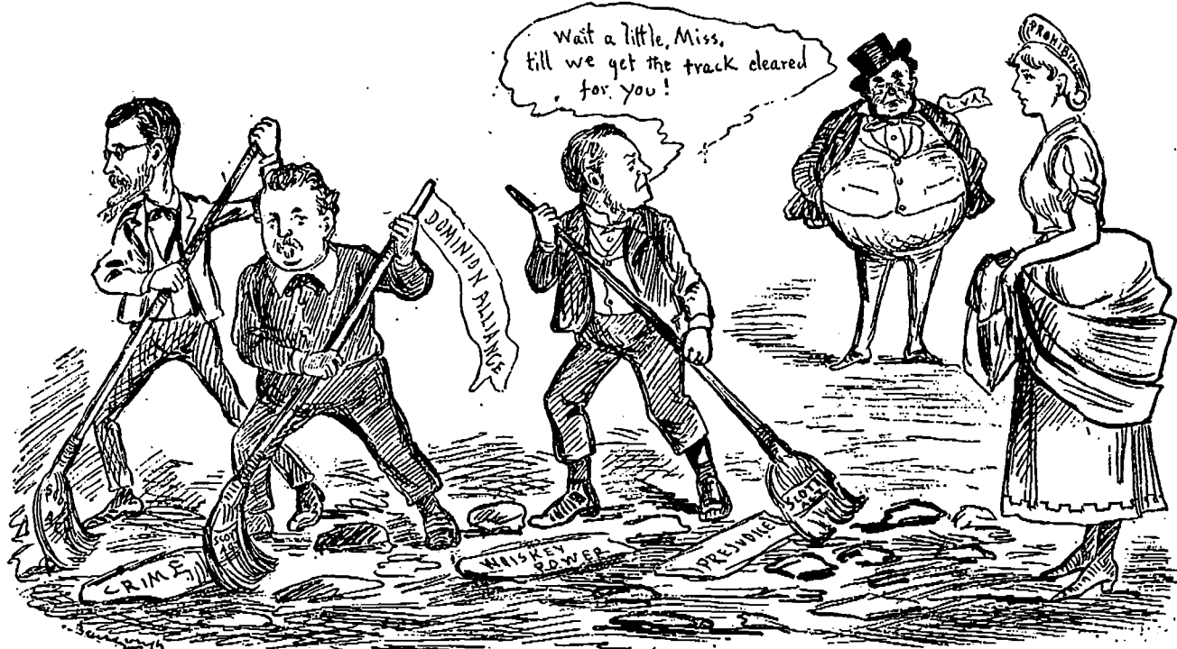
CLEARING THE PATH FOR PROHIBITION.

MACHINE OILS { Four Medals and Three Diplomas awarded at Leading Exhibitions in 1881 } McCOLL BROS. & CO., TORONTO.