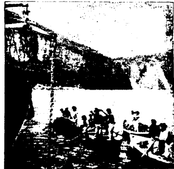
DIVING FOR PENNIES. OFF CAPRI.

a courier—a good fellow, who helped to make Spain a pleasant memory. We had never before felt the need of a valet-de-place , but Spain is one of the few countries where such a companion is exceedingly useful. The natives of Spain talk Spanish—and nothing else—with remarkable unanimity, and one must have a local guide in every town unless he has a courier. We paid our man $2.50 a day and his expenses, but the latter were only his railway fares, as the hotels charged nothing for him, in consideration of the fact that he brought guests. We traveled second-class on