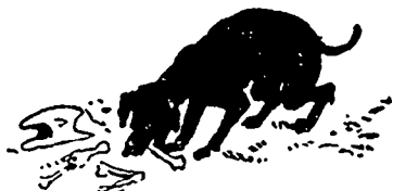
CHAPTER II - CHRISTMAS NIGHT.