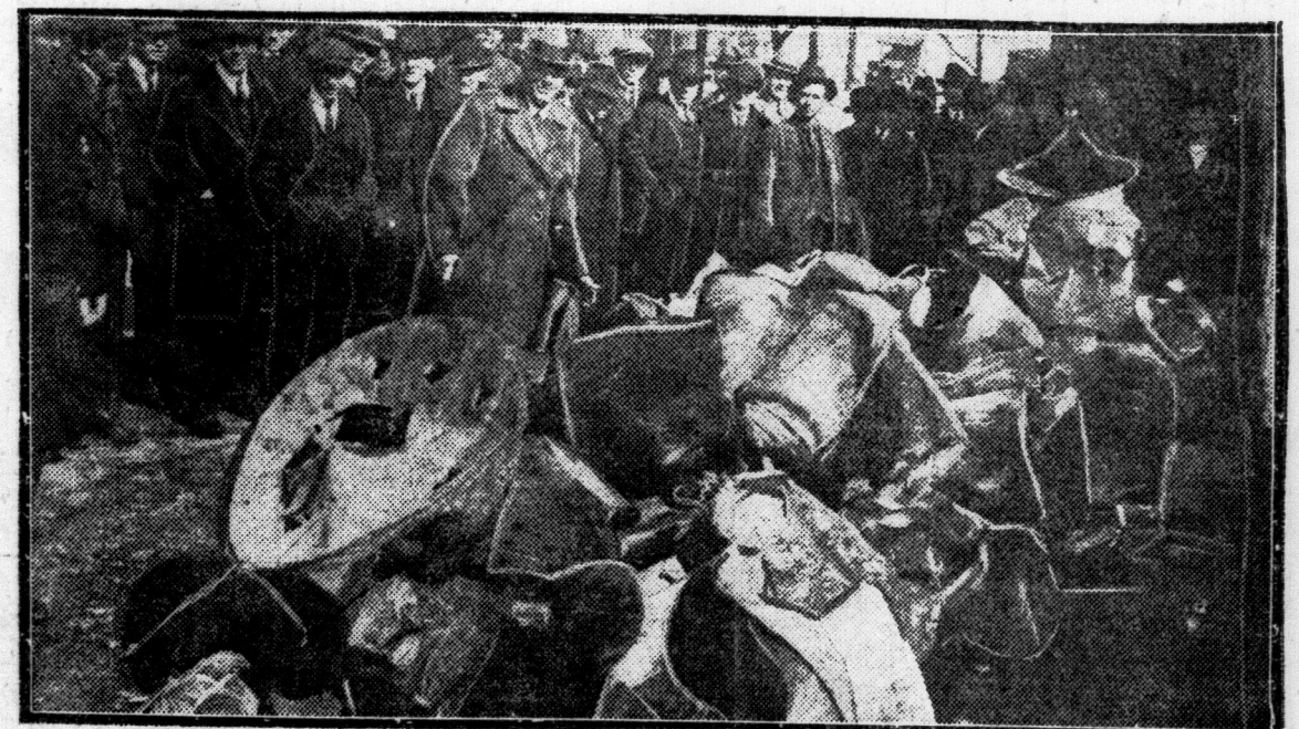
The text of one of Billy Sunday's sermons. Thirty stills which he destroyed on a recent visit to Knoxville, Tennessee.