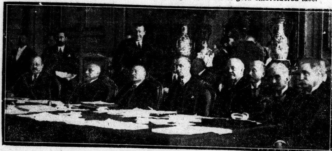
The opening of the 23rd session of the council of the League of Nations at Luxembourg. M. Viviani is presiding. Hon. Arthur Balfour, representing Britain, is fourth from the right.