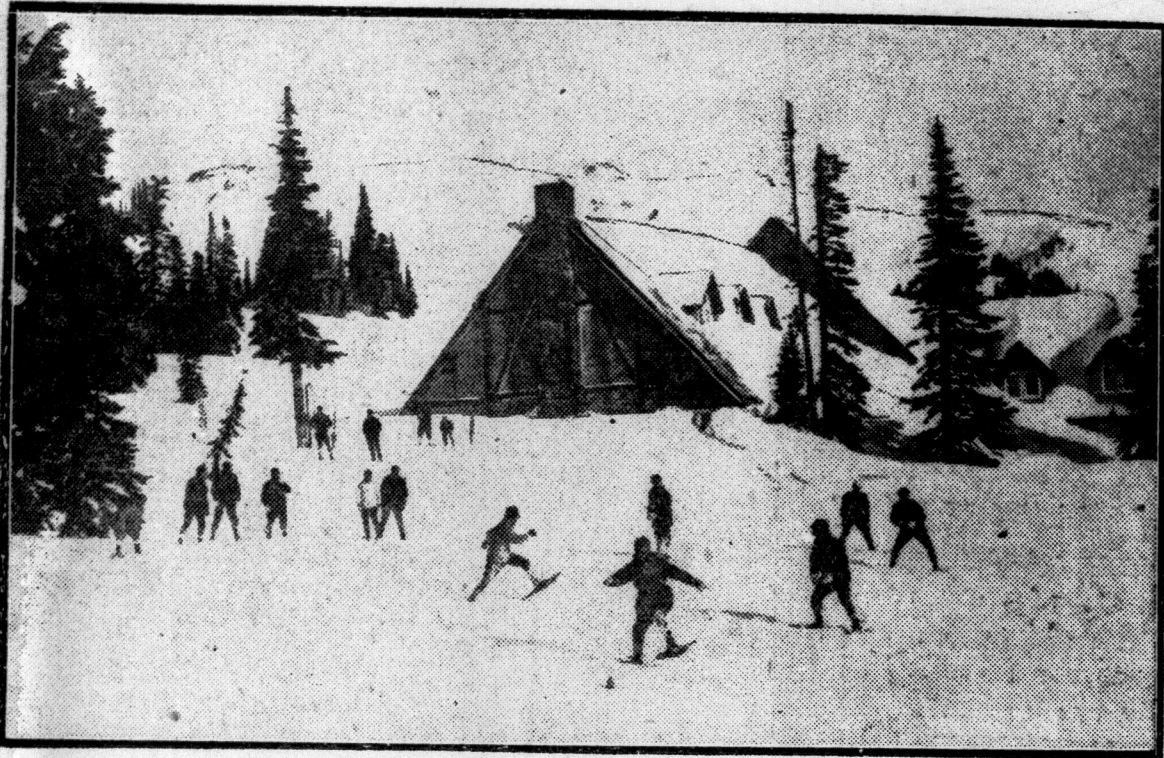
Baseball on snow shoes. A party of business men on a holiday at Ranier Park.