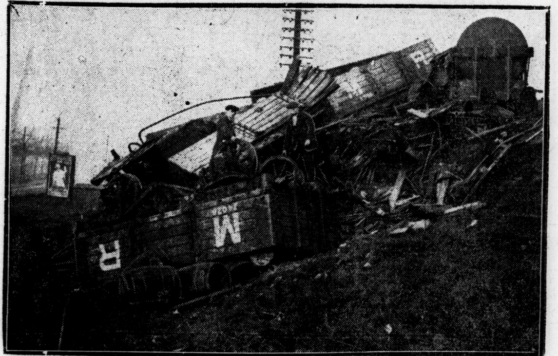
The rear end of a goods train near Shepherd's Bush, London, W., England, which broke away and crashed over a 40-foot embankment.