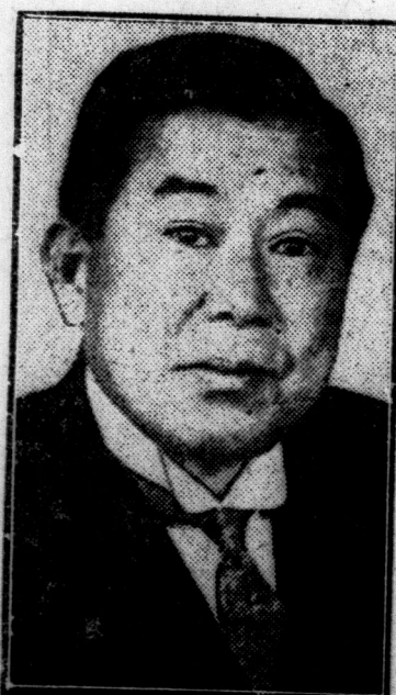
Masanao Hanihara, new Japanese ambassador to the United States.