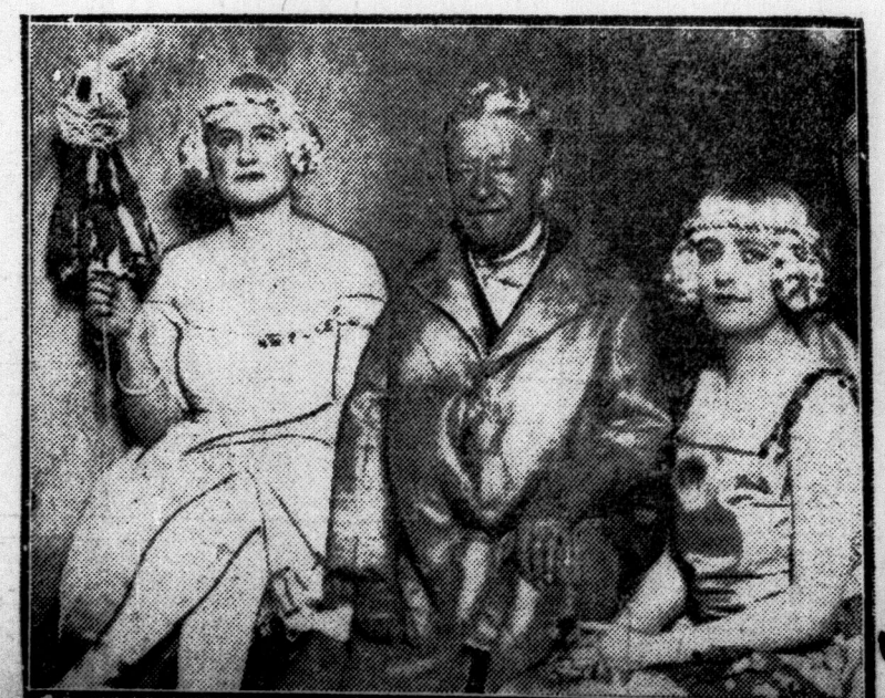
Lord Leverhulme snapped with a couple of the masqueraders at the Chelsea arts ball.