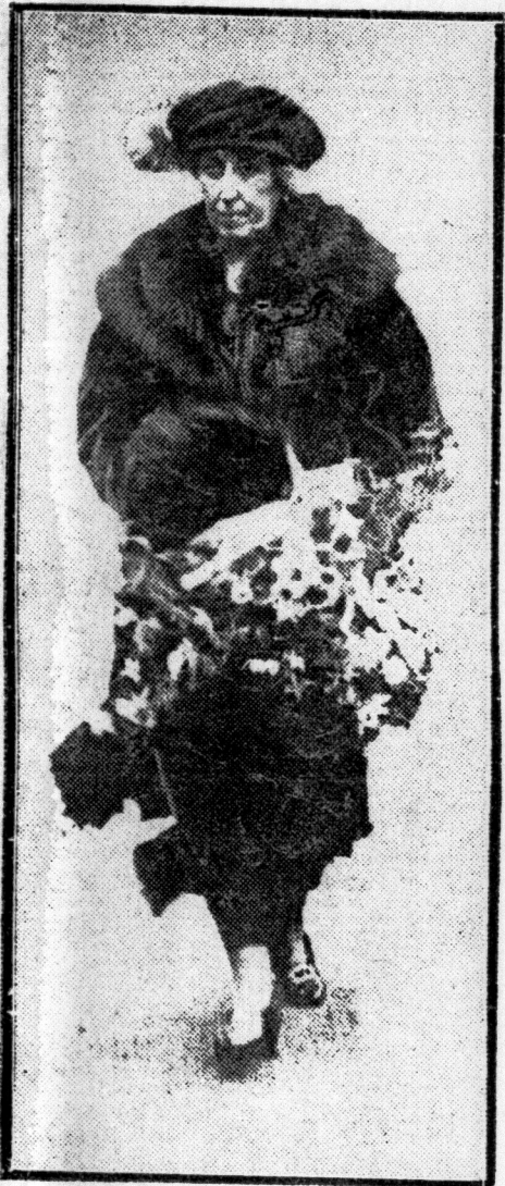
Princess Victoria after opening a new children's ward in Guy's Hospital.