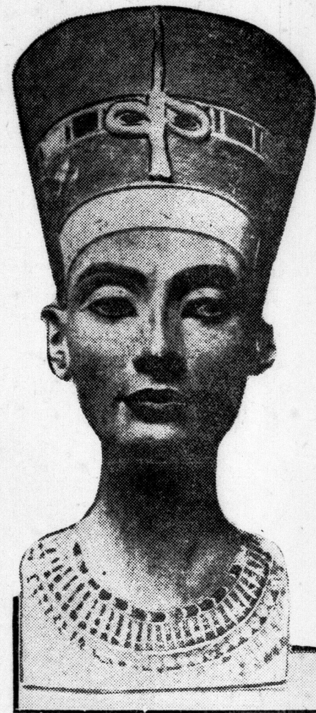
Head of a statue of Queen Nefertiti, wife of Akhenaten, the heretic king who was Tutankhamen's father-in-law.