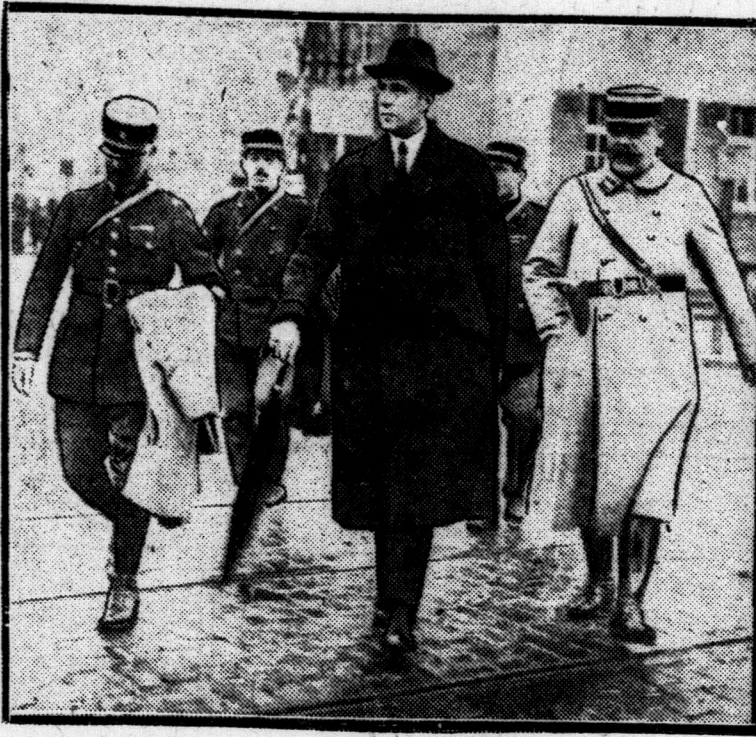
The German collector of customs at Dusseldorf being placed under arrest by the French.