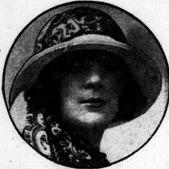
First aids to beauty. On the left, a Deauville kerchief draping the crown of a hat and forming a scarf on the right hand side. At the right a model of gold embroidered lace.