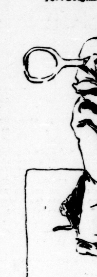
THE DAVIS CUP—THE HEATING POT OF THE SPORT WORLD