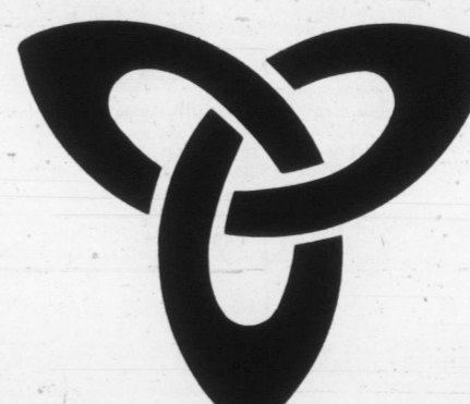
Emblem of the Registered Nurses Association of Ontario

"Therefore we have to have a voice in our own affairs — the