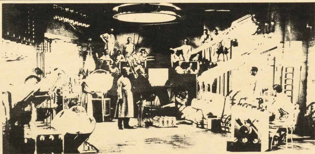
"Maybe we should plug it in?"