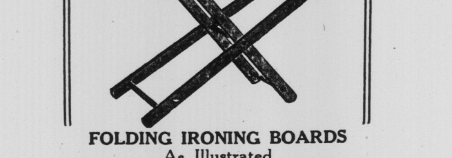
FOLDING IRONING BOARDS As Illustrated