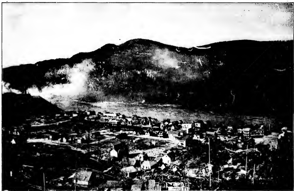
Town of Trail.