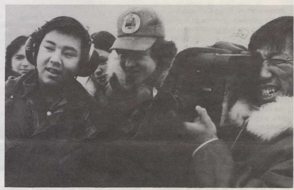
Cameras roll during filming by Canada's first Inuit-language television network.

Magic in the Sky, a documentary film investigating the impact of television on the Inuit people of the Canadian Arctic, has been produced by Investigative Productions and the National Film Board of Canada.