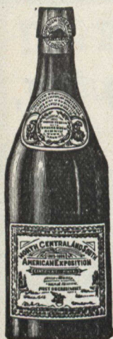
FAC-SIMILE OF WHITE LABEL ALE