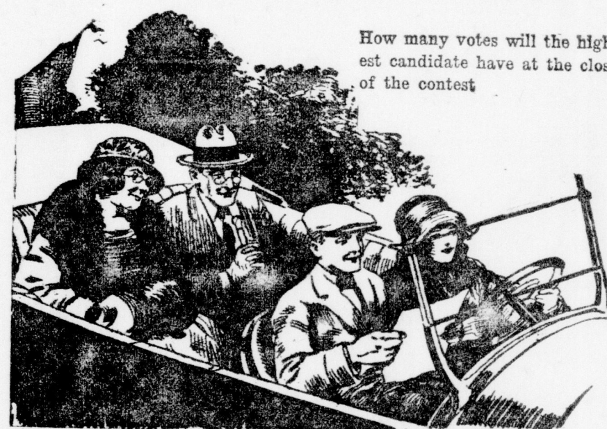
How many votes will the highest candidate have at the close of the contest?

The Family Car Are You Good at Guessing? A Test of Real Skill