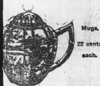
Mugs, 22 cents each.

and Fawn, shades traced ..... $13.00 Set.