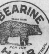
BEADINE FOR THE HAIR

It is well to have on hand a remedy, simple, effective and easily applied, for mosquito bites, insect stings, sores, bruises, sunburn, and injuries to the skin, and forty other ailments that are always dangerous, but which can be cured by outward application. Such a remedy is Davis' Menthol Salve (The D. & L.), which comes in tins for 25c. at druggists.