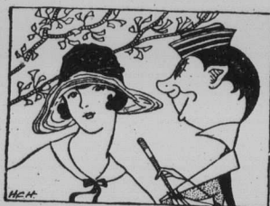
The Wandering Mind.

Of particular practical significance is the fact that by December 12, two months after storage, the polished apples in this particular lot had become so wilted that they were practically unmarketable, while the unpolished portion was in good marketable condition.