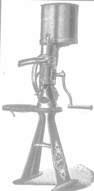
We sell the easy-running