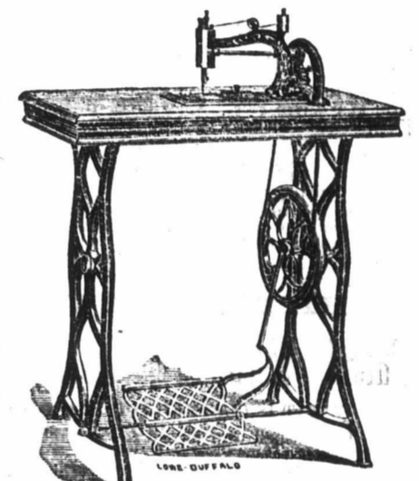
No. 1. Plain Top. Price $32.