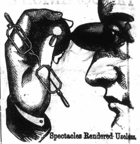
Spectacles Rendered Useless.