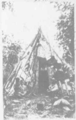
INDIAN WIGWAM, DARTMOUTH.