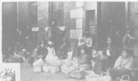
A SATURDAY MARKET SCENE.