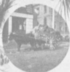
OX TEAM, MARKET DAY.