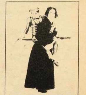
LES BALLETS TROCKADERO