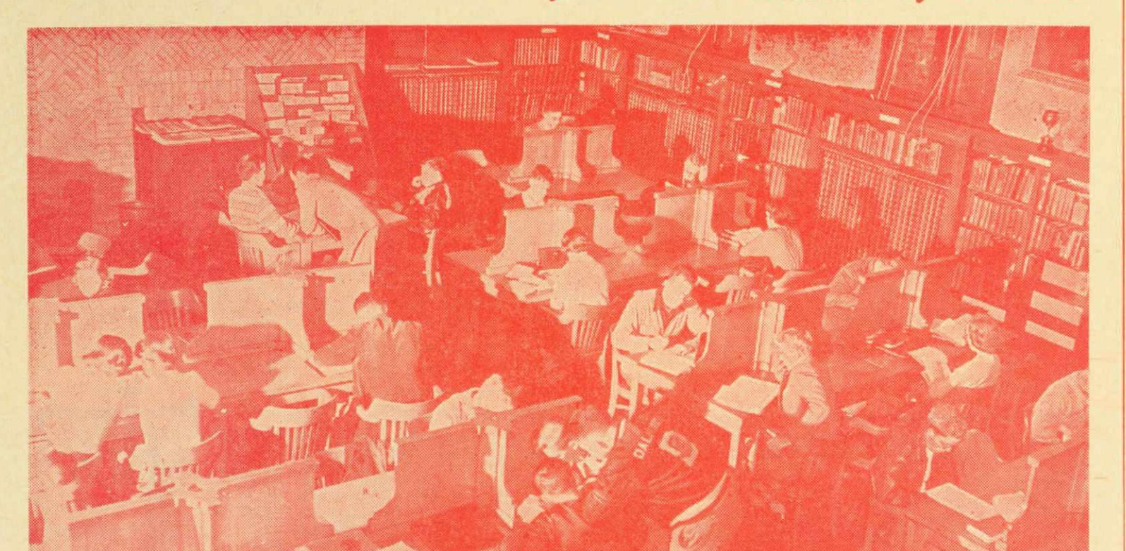
But a lot of dust, by handfuls or perhaps only pinches, is being blown off the books in the Macdonald Memorial Library, as students settle down in earnest to their preparations for examinations. Shown above is a corner of the main reading room in the Library. Line forms to the left, please! It is, of course, only fair to explain that most of the dust is not acquired through disuse, but because construction is underway on the adjoining Kipling wing.