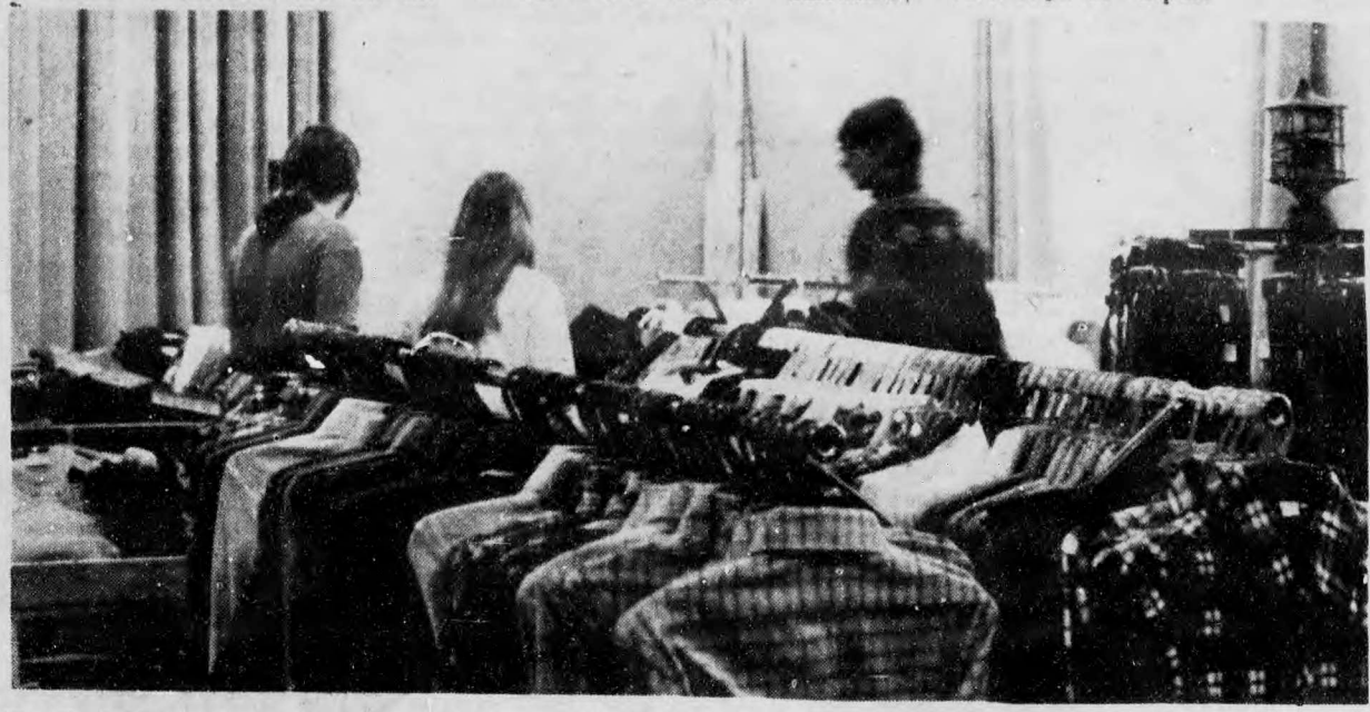
The Dud Shoppe has moved - and changed its name too. Now called SUB Towne, the shop has expanded facilities and selection. The move was made necessary by renovations in the SUB lobby to allow for a new

SUB Towne is open from 10 to 9 week days and 12 - 6 on Saturdays. Saturdays 12 - 6 p.m