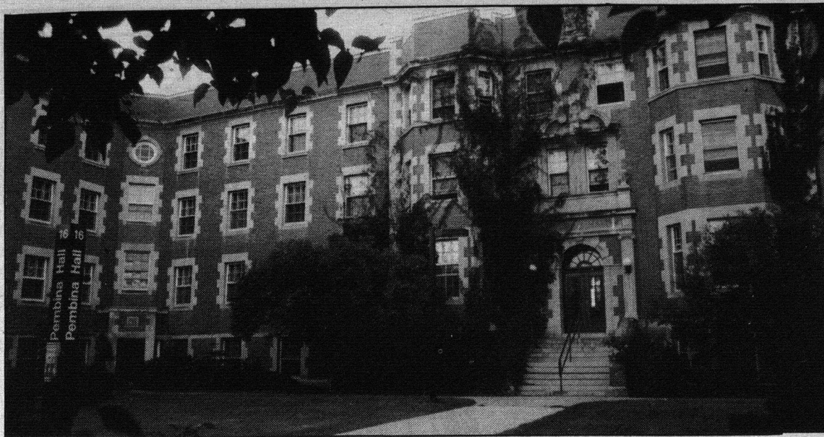
Historic Pembina Hall