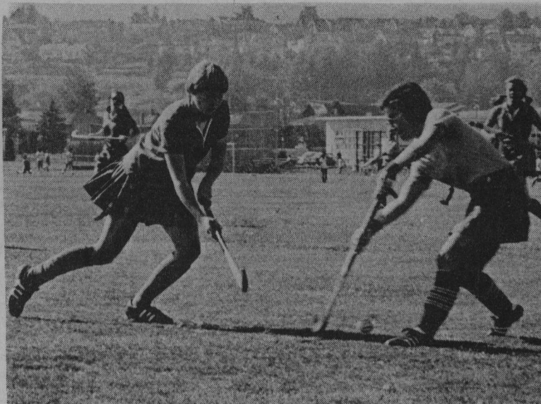
PANDA field hockey action