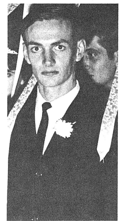
WHERE AM I? - This cheerful young man was one of the many campus stalwarts who attended the Wauneita

ic chaplain. "What we do need is a department of theology whose studies would range wider than Christian-It would, of course, include