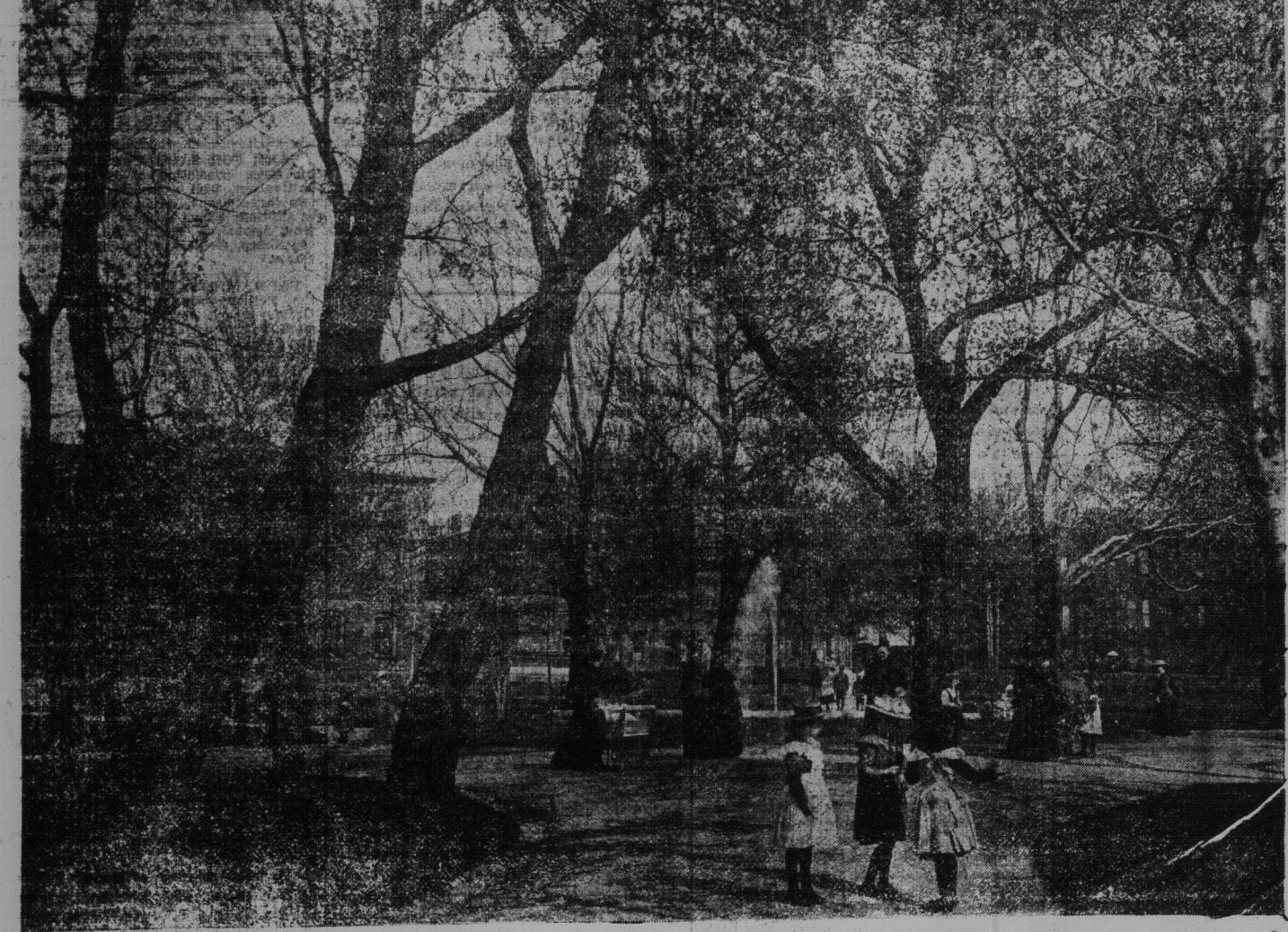
KING SQUARE, A FAVORITE SUMMER RESTING PLACE.