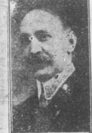
JOHN CAMERON, his record is WILLIAM LODGE will make a good before you and needs no comment legislator for the entire com-

OUR WEEKLY BRITISH LETTER. WESPMINSTER, England (1 day)—The King's speech on prorogation of Parliament refers