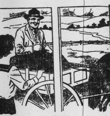
"You'll like the flavor"