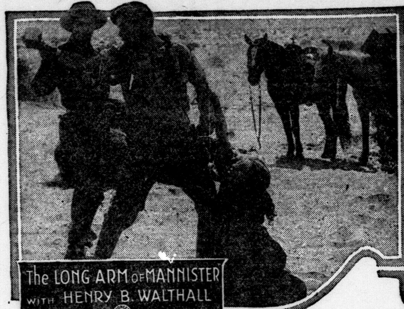
Written by E. Phillips Oppenheim and shown at the Allen next Thursday, Friday and Saturday.