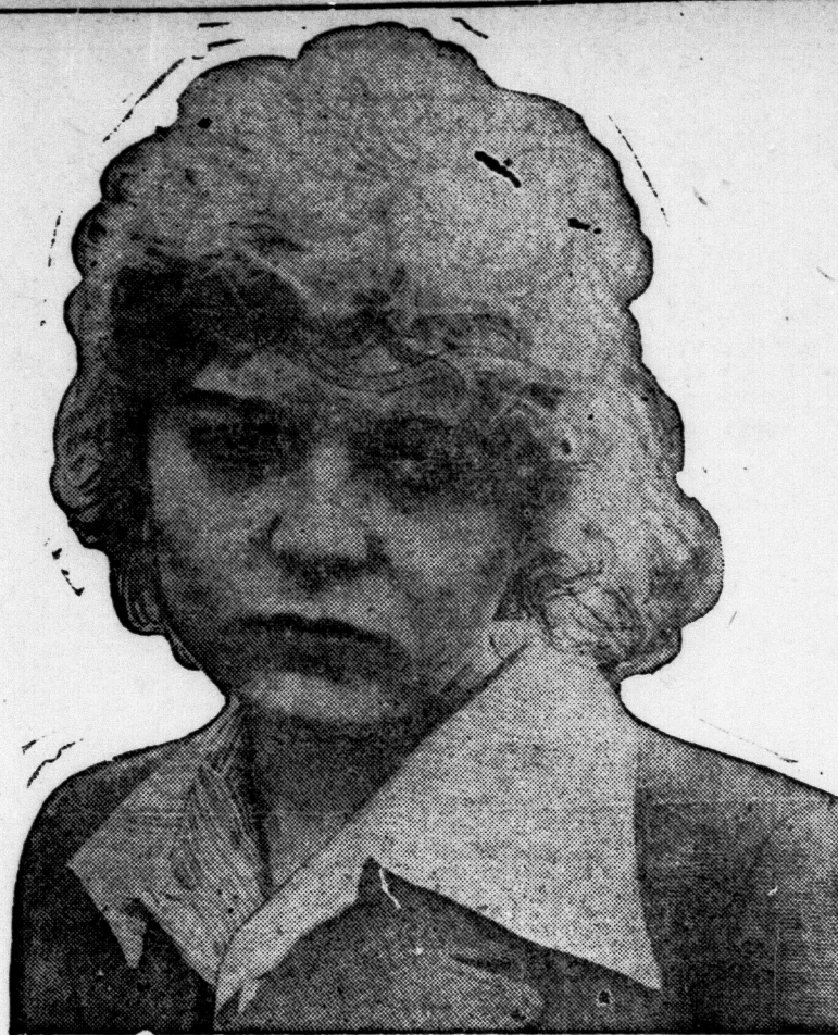
Dainty and demure Blanche Sweet, who will grace the screen at Port Stanley for Monday, Tuesday and Wednesday next, in "Fighting Cressy," a sweetheart romance of rugged California.