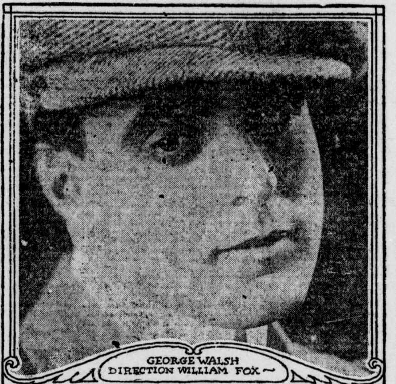
At the Patricia Theatre next Thursday, Friday and Saturday in his latest comedy drama "Help! Help! Police!"